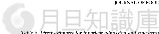
Table 6. Effect estimates for inpatient admission and emergency visits of Clostridioides difficile infection.