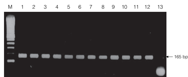
Figure 1. Agarose gel electrophoresis of PCR amplifications of gene fragment of 12S rRNA with primer L1373/H1478 of authentic turtle specimens. Lane 1-12: PCR products of 12 turtle shells, numbers: 1: Ie, 2: Sc, 3: Kt, 4: Mo, 5: Ca, 6: Ms, 7: Sq, 8: Mi, 9: Mt, 10: Cr, 11: Pm and 12: Hg, respectively; lane 13: extract control; lane M: DNA 100-bp ladder size marker.

The PCR products of cytochrome b gene of 12 turtle references were directly sequenced for evaluation due to lack of sequence data of cytochrome b gene in Genebank. After sequences of Pair-Wise alignment analysis of PCR products of 12S rRNA and cytochrome b genes, the rooted dendrogram were generated as shown in Figure 3. Sequences of 12S rRNA fragment could be properly distinguished among the 12 turtle references, with sequence difference of each pair of about 7~23%.